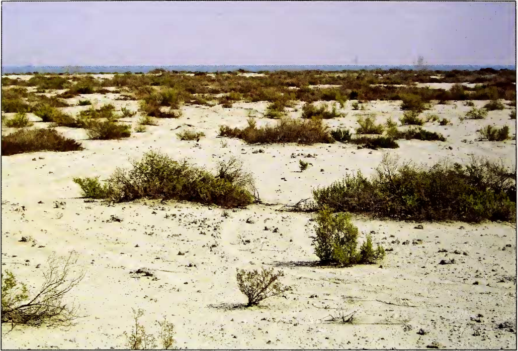
Fig. 1. Halophyte-dominated breeding locality for B. exilis , ‘Half Moon Bay’, 15 km SW Dhahran, eastern Saudi Arabia.